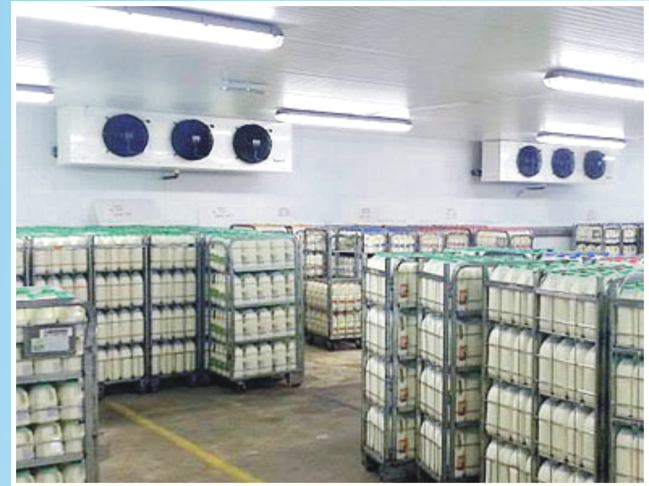
STORAGE OF MATERIALS IN COLD ROOM