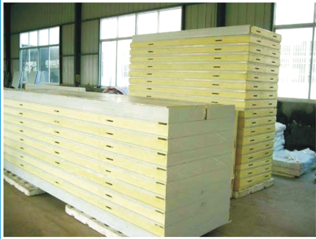
CNC FABRICATED PUFF PANELS WITH CAM LOCK SYSTEM