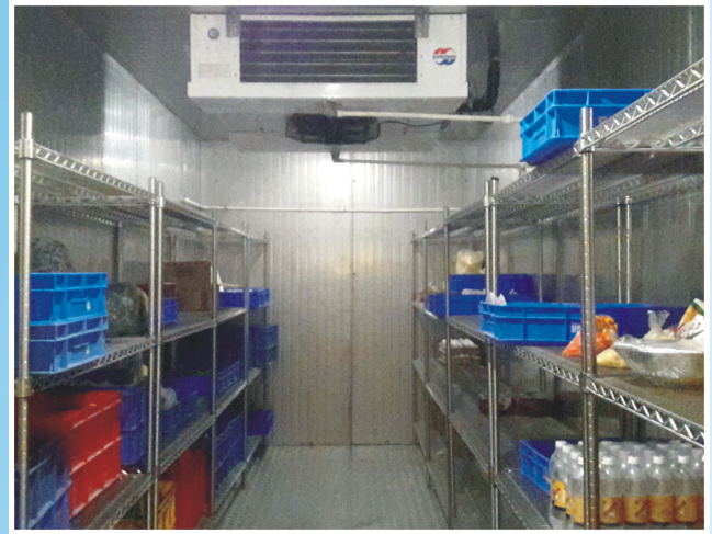
INTERIOR OF A COLD ROOM WITH EVAPORATOR UNIT & SHELVING